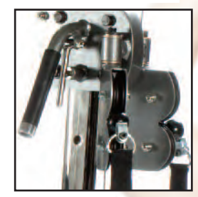
Quick release counterbalanced pulley carriage offers safe and easy adjustments with dual rotating pulley handles.